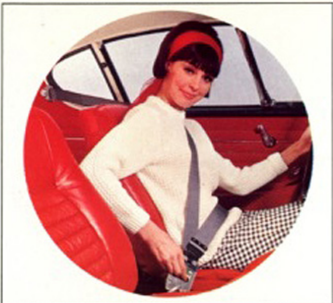
All controls are easy to reach with the seat belt firmly on.