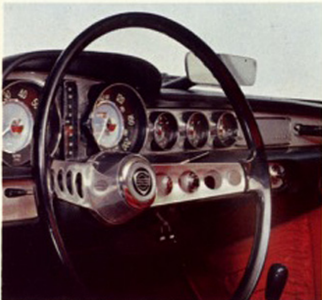
Speedometer and tachometer immediately in front.