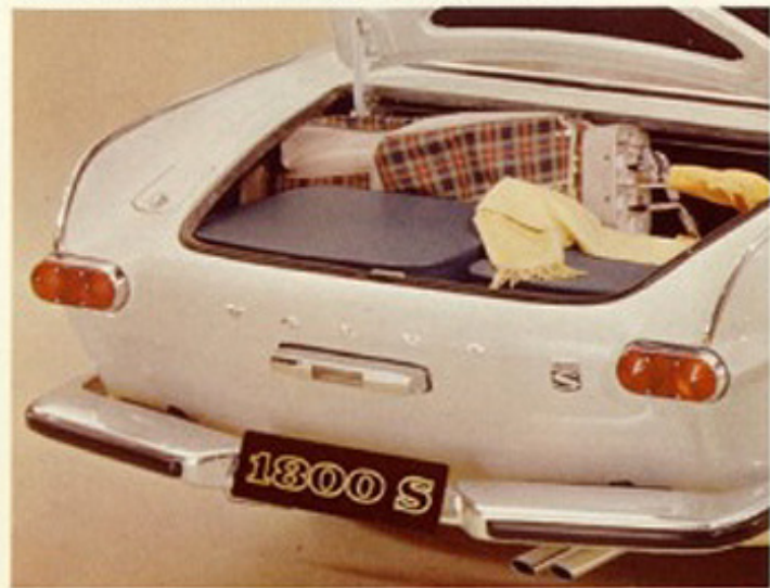
Exceptional luggage capacity.