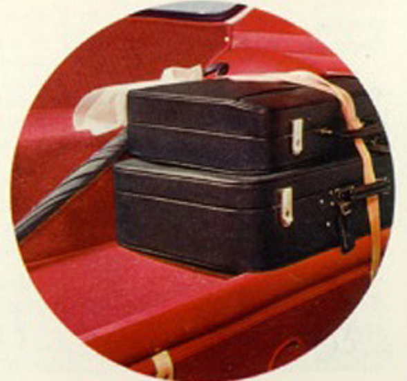
Occasional seating behind the driver. Very exceptional luggage carrying capacity with leather strap tie-downs.